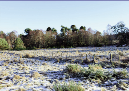
Dores 4 miles