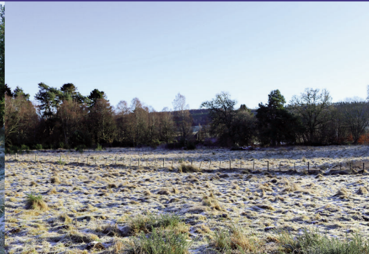
Inverness (centre) 5 miles