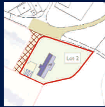
Inverness 23 miles